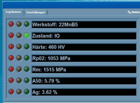
Left: Two-part probe for automated inspection of gear wheel Right: 3MA result of press-hardened body part testing